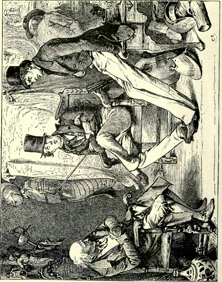
HIS GRANDSON AND HIS STRANGE COMPANION.